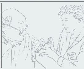
Silver Care Center