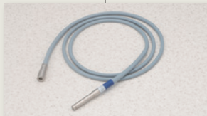
Light Guide Cable