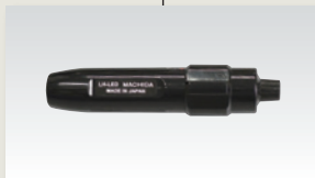
Portable Light Source